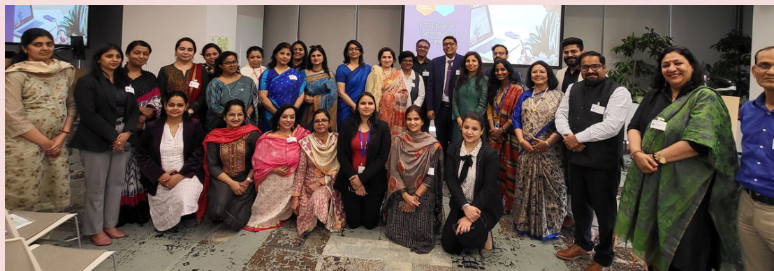
ETF at Microsoft IDC, Noida