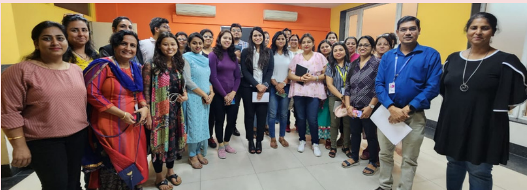
Sapphire International School, Noida